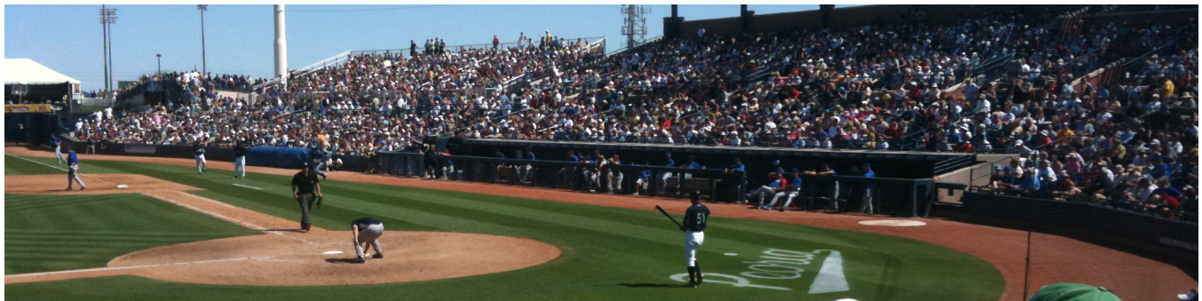
Figure 1. This is a teaser

Anonymous Author(s) Submission Id: 123-A56-BU3